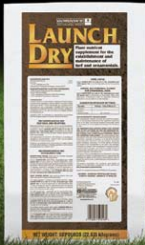
Launch® Dry Plant Nutrient Supplement