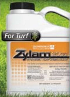
Zylam® Chewing & Sucking Insect Control