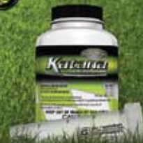
Katana® Sedge & Broadleaf Weed Control