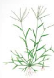
[fig. w-42] Digitaria sanguinalis

Take a good look. You may never see them again.