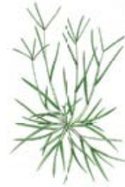
[fig. w-76] Eleusine indica