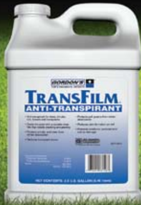
TransFilm® Anti-transpirant and Desiccation Protection