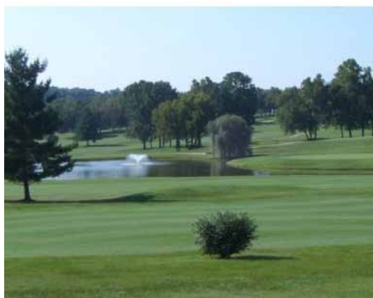
Lake Valley Golf Course