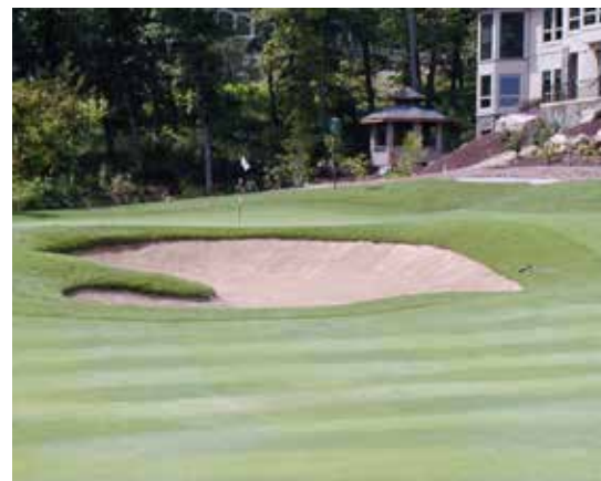
Old Kinderhook Golf Club

9:00 a.m. - Registration 10:00 a.m. - Shotgun Start 4:00 p.m. - Brookside-Agra Shootout & Dinner