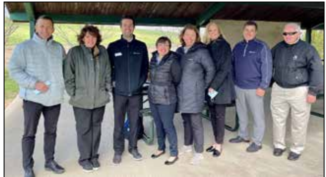
GCSAA Officers, Directors, and Department Heads