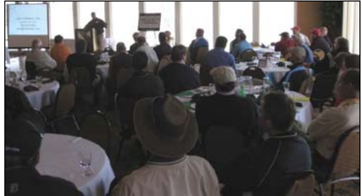
Full House for the Joint Meeting with KGCSA.