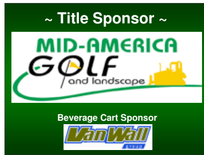
Special Thanks to our Sponsors

As you know, the S&R Tournament raises money for the benefit of research, scholarships, and our full-time staff who are trying to earn a degree. This would not be possible without the support of our vendors, volunteers and participants. I would like to thank all our vendors in advance for all their continued support, especially through difficult economic times. If any HOA member has a comment or suggestion we would love to hear from you.