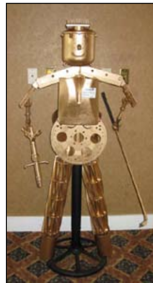
New trophy created by KGCSA Members (creative & impressive). Trophy went home with Heart of America GCSA.