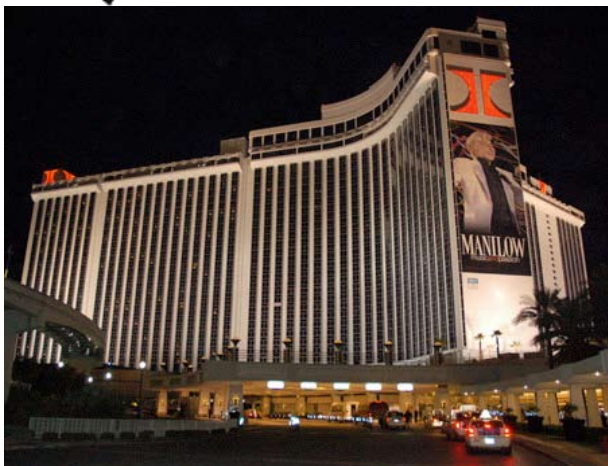
One Block from the Convention Center